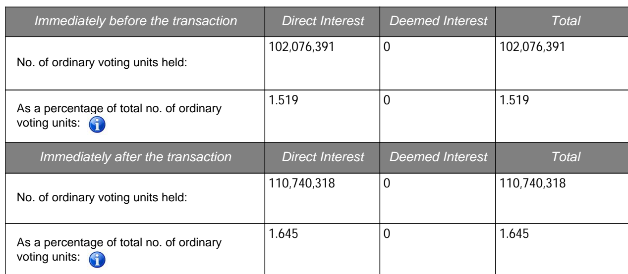
Table 1. Change in respect of ordinary voting units of Listed Issuer